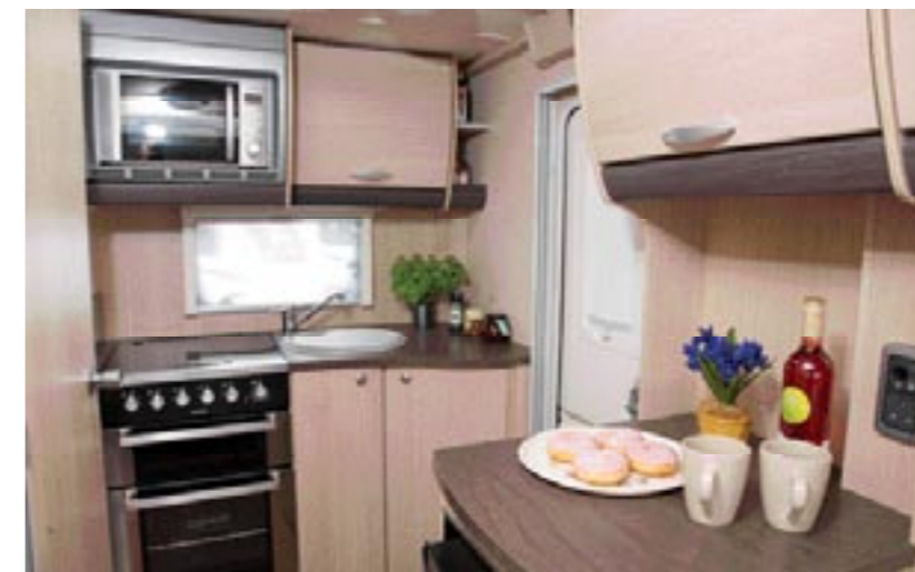
Fridge top and curved kitchen surface give you enough space

Axles: 1 Berths: 2 MRO: 1026kg MTPLM: 1350kg Overall length: 5.52m Width: 2.23m Headroom: 1.95m