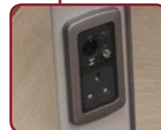
A single socket and television connecting points at floor level