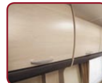
Pale wood with dark wood edging create a stunning look