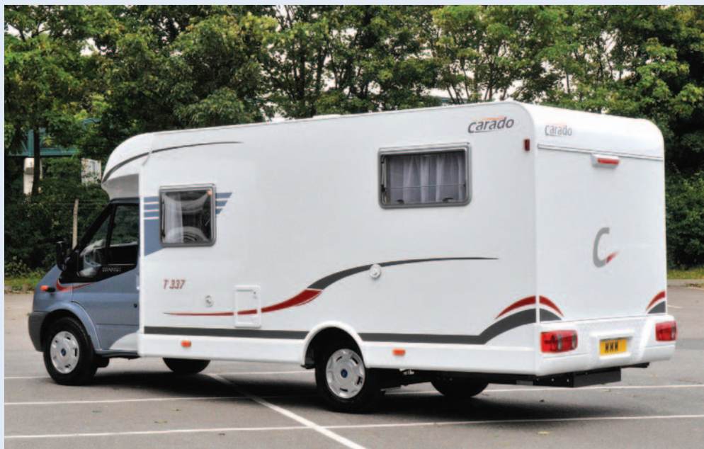
20 A sliding flyscreen door and cassette step grace the (UK) offside entrance